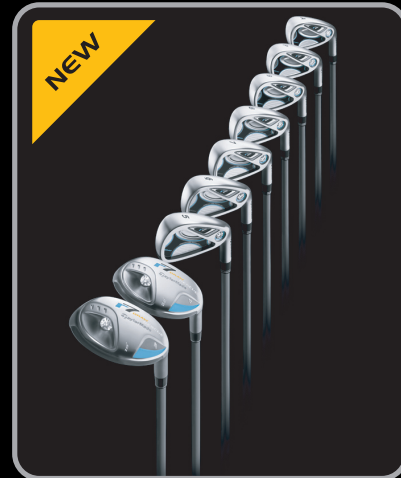
r7 ® DRAW WOMEN'S COMBO