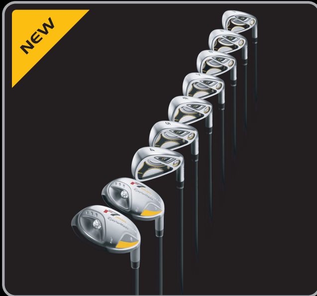
r7 ® DRAW MEN'S COMBO